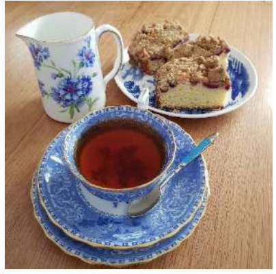
Allow to cool before slicing and enjoy with a fresh cup of tea or coffee.

To make the cake base, cream together the softened butter and the sugar. Beat in the vanilla essence, and then the eggs, one at a time. Mix well. Gently fold in the sifted SR flour with enough milk to make a smooth cake batter. Evenly spread the cake mix into the lined slice tray. Place the sliced plums in a single layer over the top of the cake mix and them sprinkle the crumble topping over the plums. The plums will cook as the cake bakes. Bake for approx. 50 minutes or until the topping is a light golden brown and a skewer comes out clean when testing the cake.