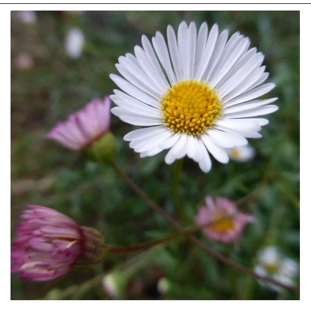
Erigeron. Erigeron is a large genus of plants in the family Asteraceae.

Open Gardens South Australia is a not for profit organisation opening private gardens to the general public. The purpose of Open Gardens SA is to educate and promote the enjoyment, knowledge and benefits of gardens and gardening in South Australia and to build strong public support for the development of gardens.