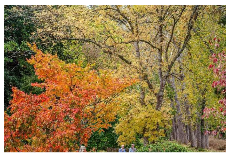
Stunning Autumn Colours at Cooinda – Mt George.

Open Gardens SA is delighted with the result of our inaugural Harvest Garden Festival – a great result with visitors enjoying fabulous productive gardens over two days in February and as a result $30,000 was donated to OzHarvest. It's always a pleasure to be able to open such interesting and inspiring gardens for our visitors. And we have another special event in April – the SA Landscape Festival is on the weekend of the 15 and 16 April 2023 – don't miss it! We also have our regular program of open gardens for you to visit. We hope to see you at an open garden this Autumn!